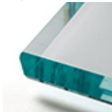
bevelled extra clear