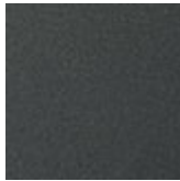
GF69 embossed graphite